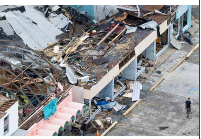
Aftermath of Harvey in Rockport, Texas.

Although it downgraded to a tropical storm as it moved inland, Harvey wasn't through spreading havoc. The storm lingered in Texas for several days,