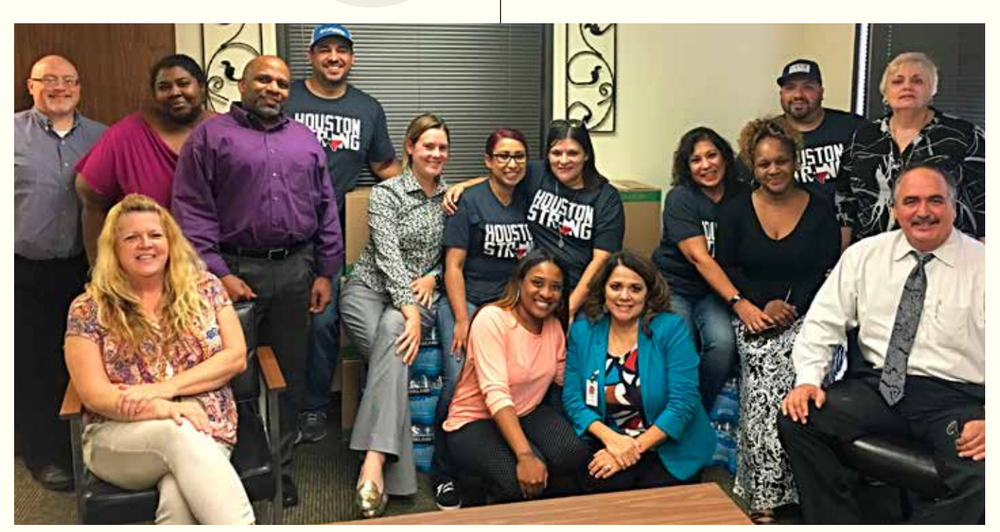
Comptroller volunteers delivered care packages and water to fellow employees in the Houston office.

The Comptroller's office is here to help Texans, from expedited purchasing of emergency equipment and supplies, special licenses for motor fuel imports, tax deadline extensions and more. We'll continue to assist in this situation and any other that arises.